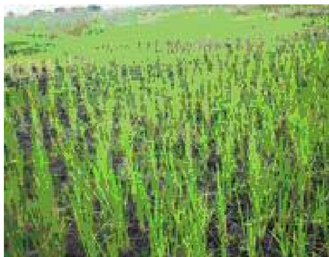
Figure3. Adaptive strategy, new rice growing project Western Zambia

Adaptation is a social response to vulnerability. It rarely involves new processes; adaptation is not about 're-inventing the wheel.' What is new and innovative is the idea of climate proofing existing sustainable development strategies. It is about the creation of choices and alternatives for lives and livelihoods (see Figure 3). Adaptation to climate change remains meaningless unless it is integrated or 'mainstreamed' into overall development strategies, addressing social and ecological pressures combining short and long-term goals, taking into account other aggravating factors such as energy poverty.