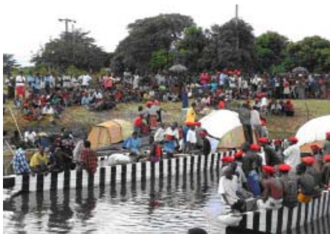
Figure 1. Vulnerability in unexpected shapes – heritage festival in Upper Zambezi floodplain

Germane here is that human and environmental vulnerability, which exists at several crosscutting human and environmental levels (see Figure 1) is caused more by socio-economic and political dynamics than by biophysical processes (see Figure 2). Increasing climate change has become an aggravating factor,